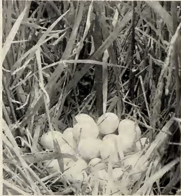
FIG. 4. Nest of 23 eggs of Fulvous Tree Duck in mature rice field at Elton, Louisiana, July 17, 1955.

Elton. a nest with five eggs was located on July 4, 1955, and one with 23 eggs on July 16, 1955 (Fig. 4). Nesting may occur even later, for three downy young, approximately 30 days old, were banded on September 17, 1955.